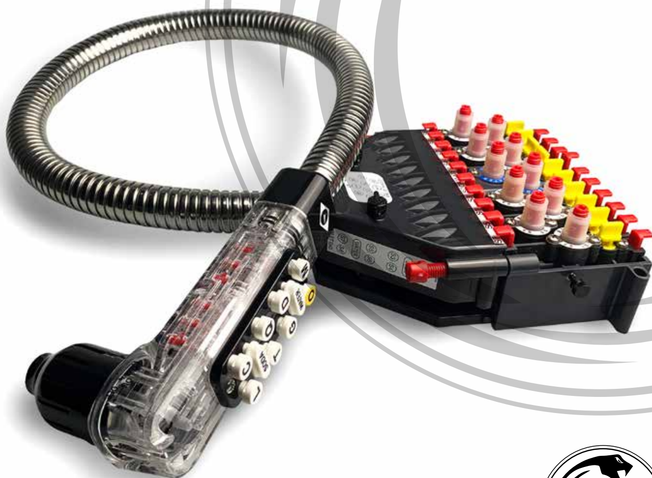
Rattler II Bar dispenser